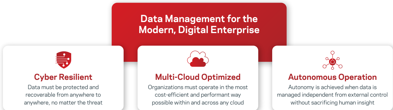
Figure 4. The core characteristics for the future of data management.

Enterprises in pursuit of digital transformation are accelerating their multi-cloud strategies. Yet, today's enterprise data management solutions are ill-equipped to meet the challenge of managing and protecting their data in multi-cloud environments. Veritas NetBackup, powered by Cloud Scale Technology is delivering the industry's first AI-powered autonomous data management solution delivered on a cyber-resilient, multi-cloud-optimized, and ultimately autonomously operated platform (See Figure 4).