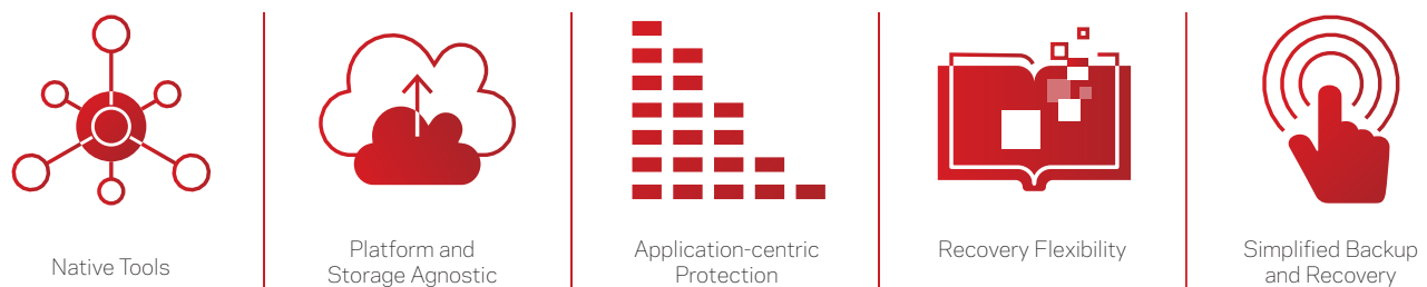
Figure 1. An overview of the features an effective Kubernetes data protection solution should provide.

With the following design principles, Veritas NetBackup offers scalability, simplicity, flexibility, and platform- and storage-agnostic and application-centric protection.