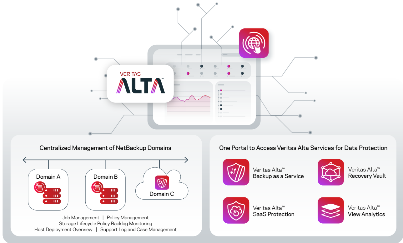
Figure 1. A unified portal, secured by default, to manage all your data protection services