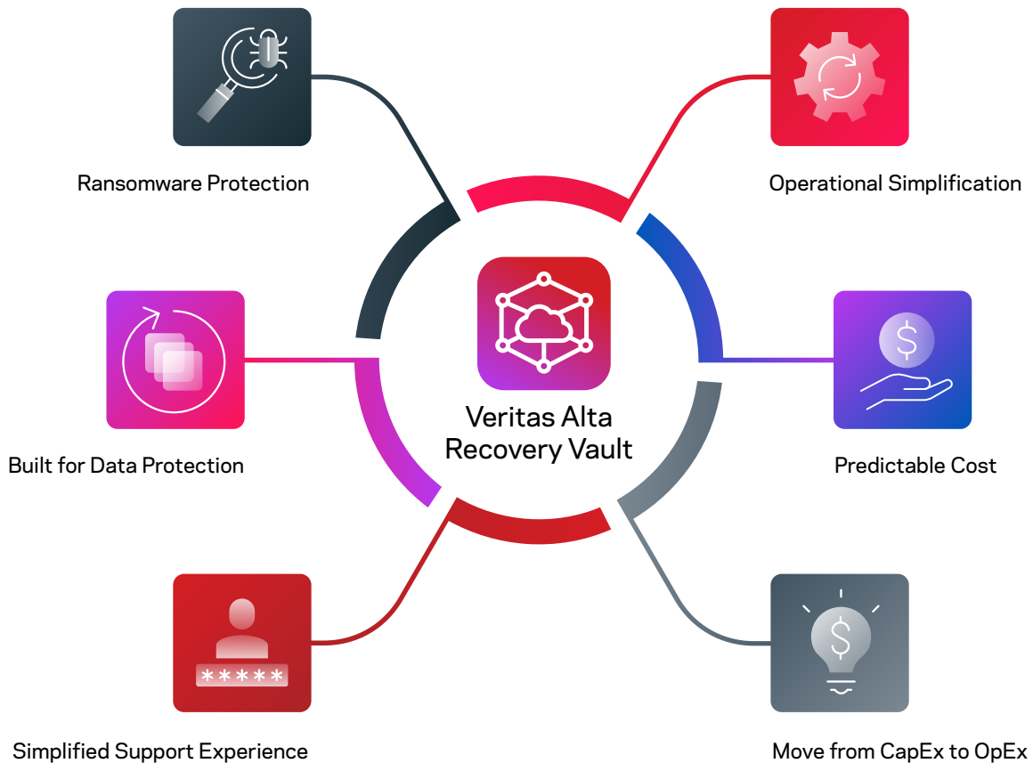
Figure 1. Why Veritas Alta Recovery Vault?