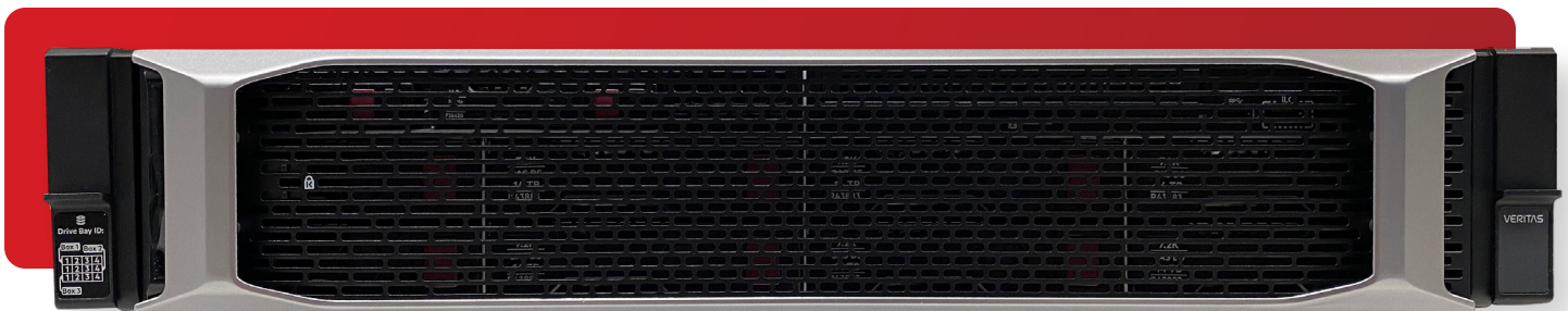
Figure 2. Veritas validated HP node, based on the HPE ProLiant DL380 Gen11

NetBackup Flex Scale is based on a hyperconverged, scale-out architecture using Veritas validated platforms. Each NetBackup Flex Scale node is an Intel-based standard hardware server pre-loaded with NetBackup Flex Scale software. NetBackup Flex Scale is deployed in a scale-out cluster of between four and 16 nodes.