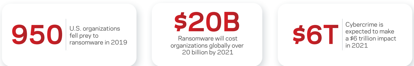
Figure 1: Data points illustrating the impact of ransomware.

Ransomware is a growing threat for enterprises, and media headlines reflect its devastating impact. Company data is being held hostage by cybercriminals, and stakeholders are forced to choose between paying the ransom or having their company's data erased or exposed. The global cost estimate for companies afflicted by ransomware will soon exceed $20 billion. Figure 1 shows the significant effect ransomware is having—or will have—on organizations and the economy.