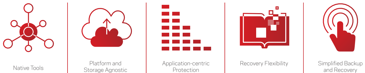
Figure 1. An overview of the features an effective Kubernetes data protection solution should provide.

With the following design principles, Veritas NetBackup offers scalability, simplicity, flexibility, and platform- and storage-agnostic and application-centric protection.