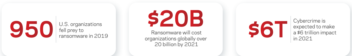
Figure 1: Data points illustrating the impact of ransomware.

Ransomware is a growing threat for enterprises, and media headlines reflect its devastating impact. Company data is being held hostage by cybercriminals, and stakeholders are forced to choose between paying the ransom or having their company's data erased or exposed. The global cost estimate for companies afflicted by ransomware will soon exceed $20 billion. Figure 1 shows the significant effect ransomware is having—or will have—on organizations and the economy.