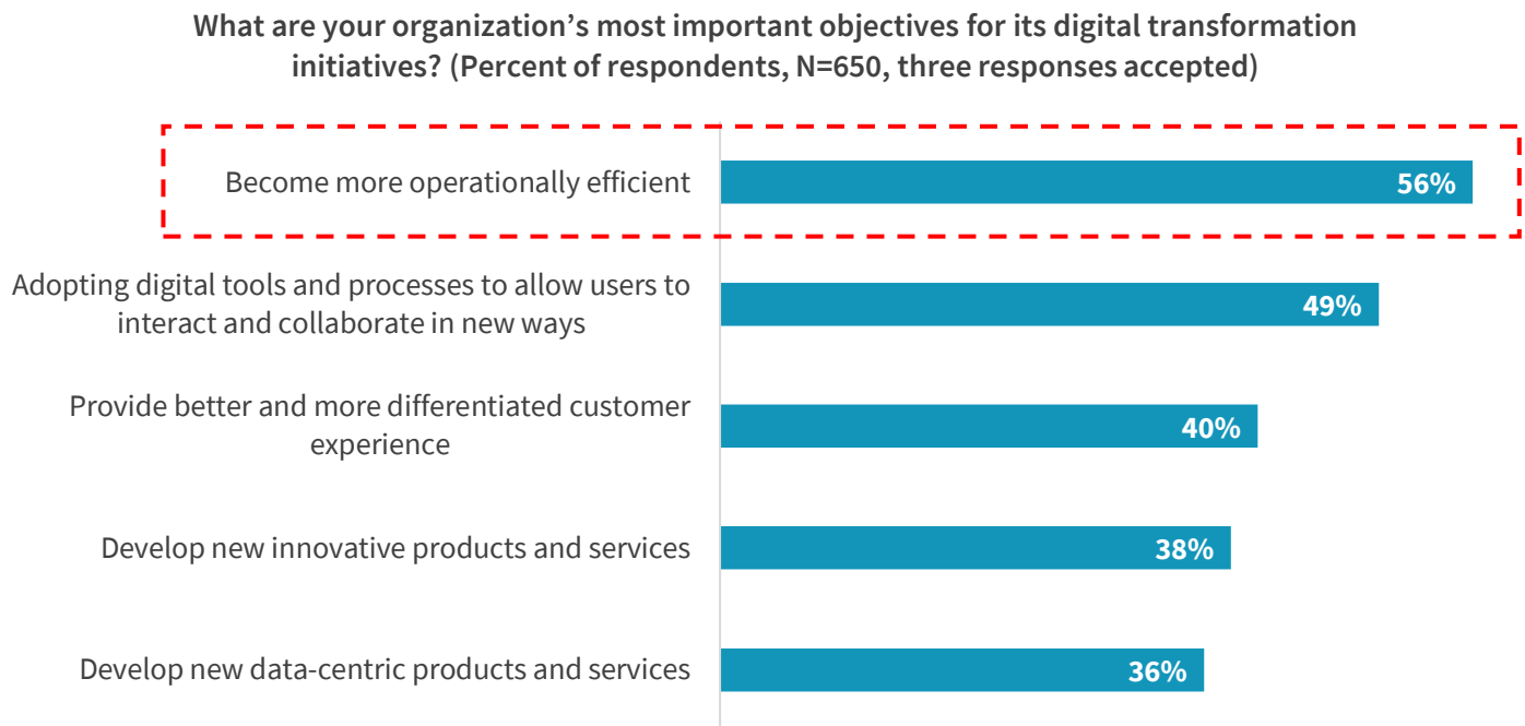
Figure 2. Top Five Digital Transformation Initiative Objectives

The bottom line, as Figure 2 shows, is that these organizations are looking to digital transformation, including in the realm of backup, as a way to boost the operational efficiency of their highly complex IT environments.