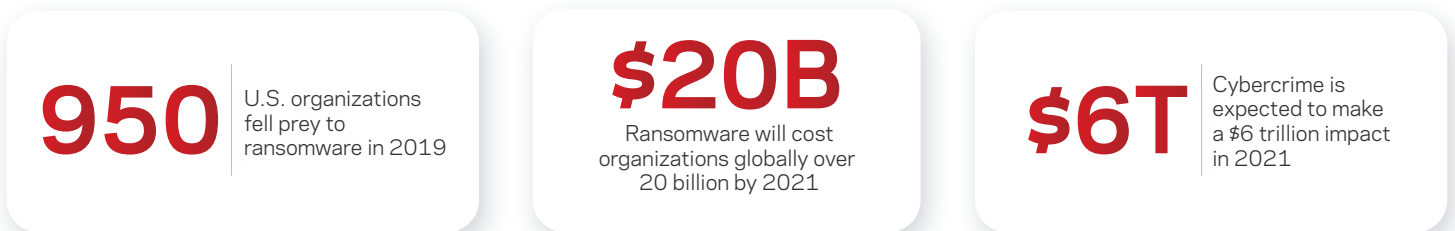
Figure 1: Data points illustrating the impact of ransomware.

Ransomware is a growing threat for enterprises, and media headlines reflect its devastating impact. Company data is being held hostage by cybercriminals, and stakeholders are forced to choose between paying the ransom or having their company's data erased or exposed. The global cost estimate for companies afflicted by ransomware will soon exceed $20 billion. Figure 1 shows the significant effect ransomware is having—or will have—on organizations and the economy.