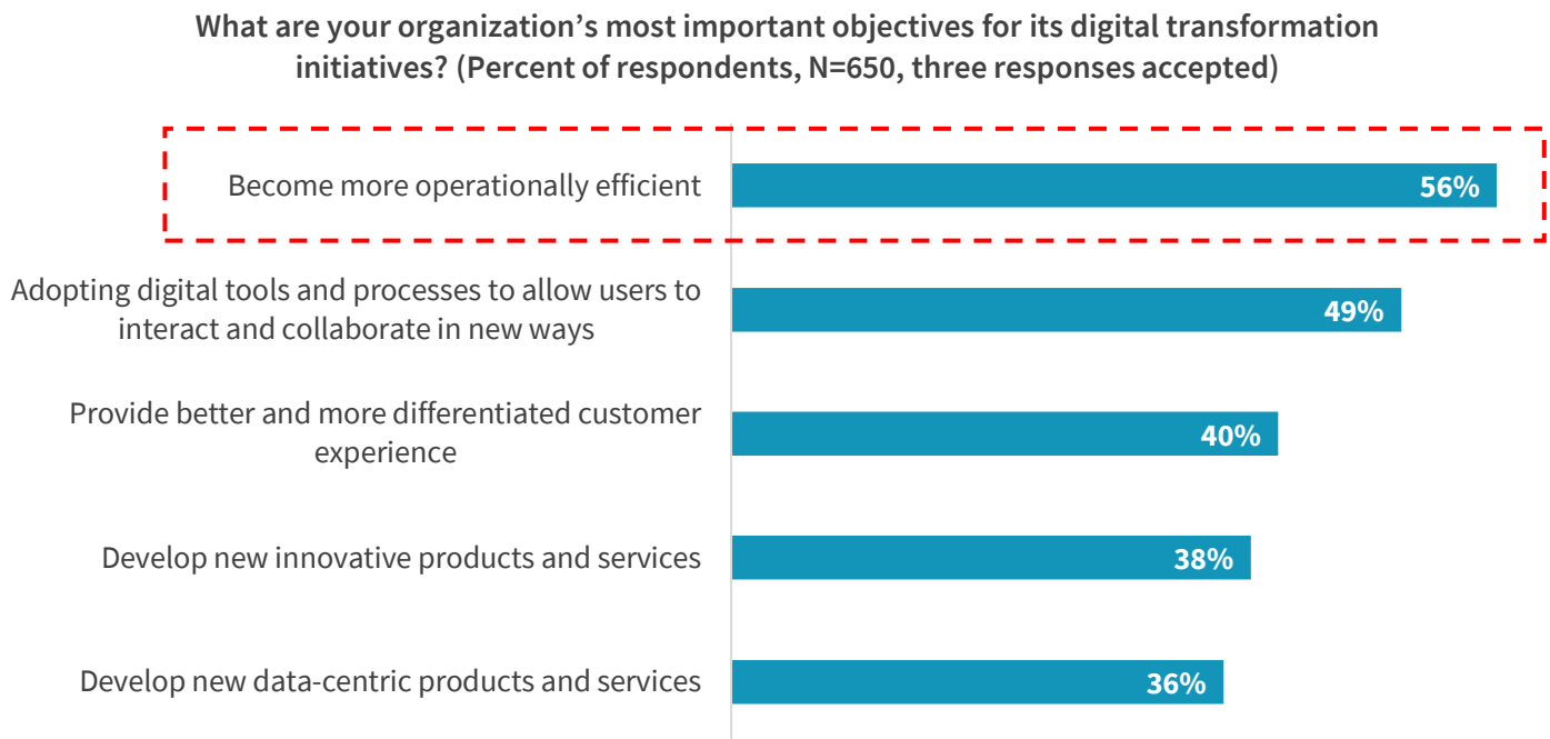
Figure 2. Top Five Digital Transformation Initiative Objectives

The bottom line, as Figure 2 shows, is that these organizations are looking to digital transformation, including in the realm of backup, as a way to boost the operational efficiency of their highly complex IT environments.