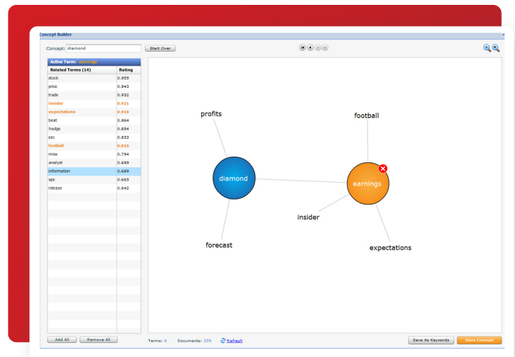
Figure 2. Concept search explorer: Provides a visual interface to dynamically explore and discover new, relevant concepts.

Advanced search —Has the ability to construct advanced searches based on numerous metadata and derived fields. It supports both stemmed and unstemmed (literal) searches and provides power-user capabilities including Boolean, wildcard, fuzzy, nested proximity searches, and prediction scores.